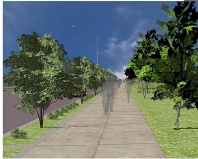
NEW VIEW LOOKING SOUTH