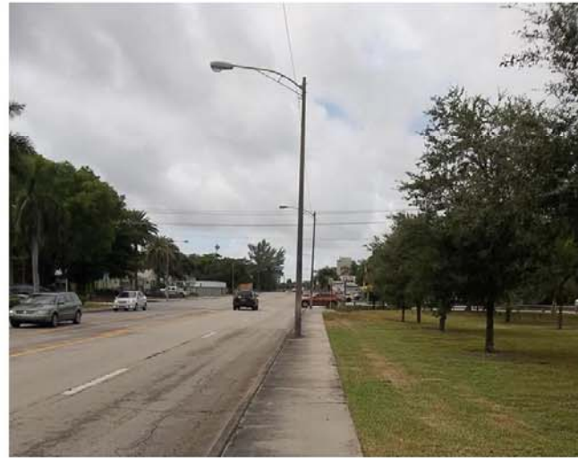
EXISTING VIEW LOOKING SOUTH