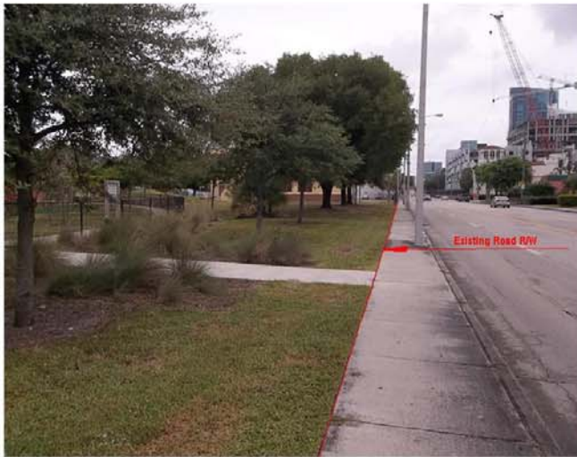
EXISTING VIEW LOOKING NORTH