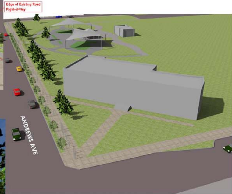
OVERALL STREET VIEW