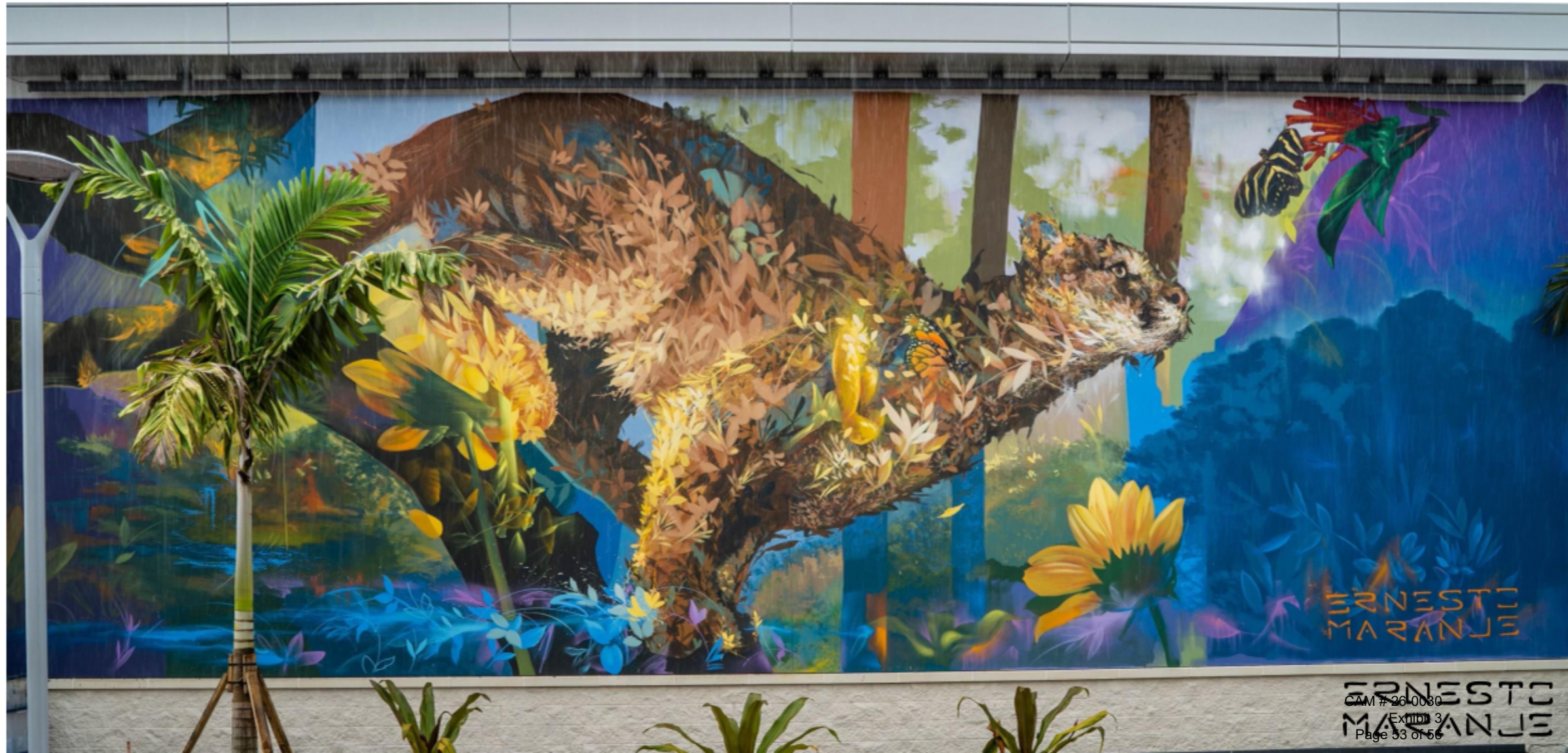
Completed mural Curiosity (2021) in Miramar, FL