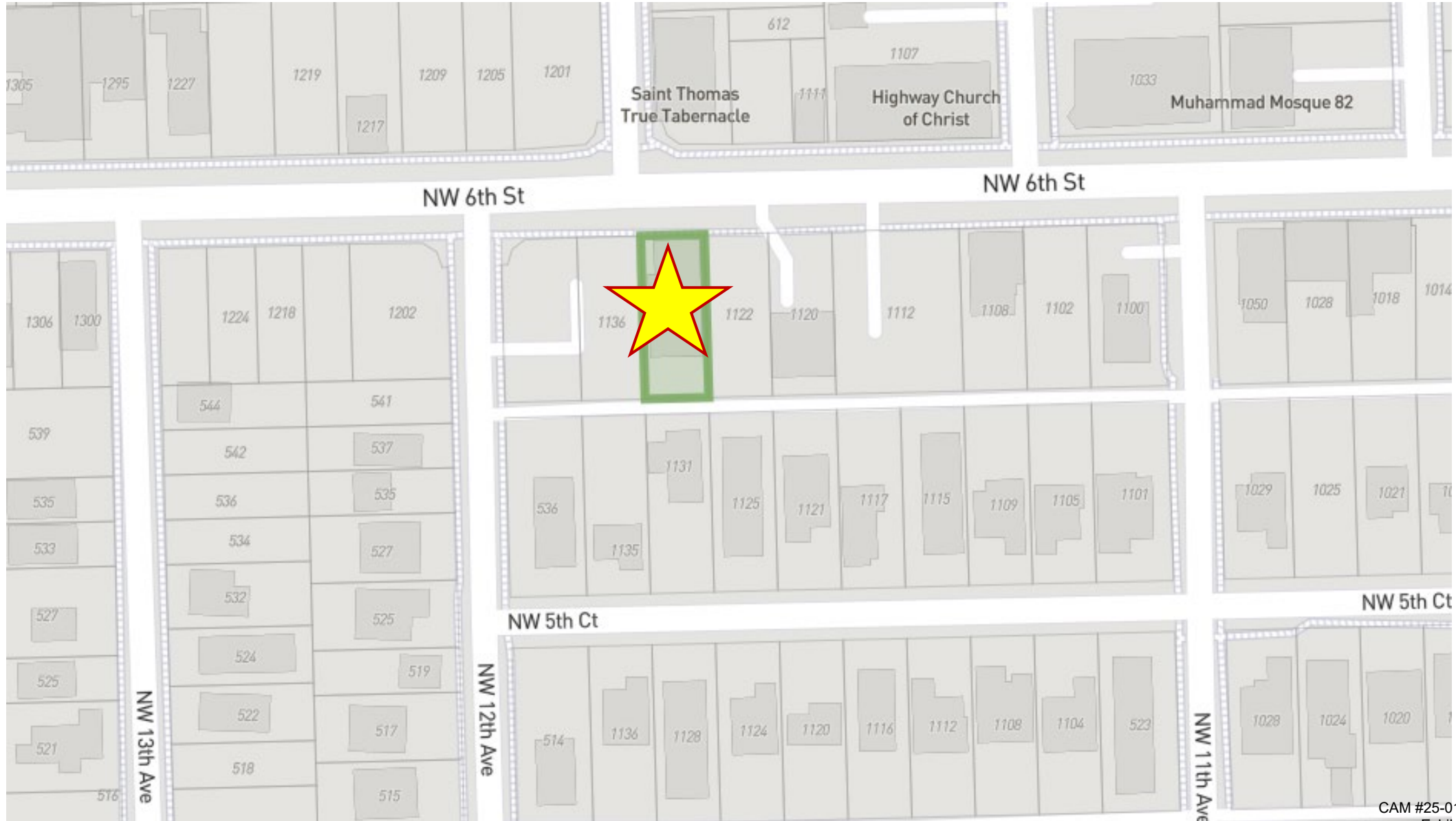
EXHIBIT C – Smitty’s Super Bowl Sunday Watch Party