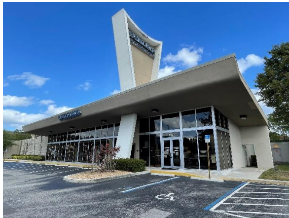
Photo of Existing Site

Historic Landmark Designation is requested for the property located at 2860 N. Federal Highway, commonly known as Castro Convertibles.