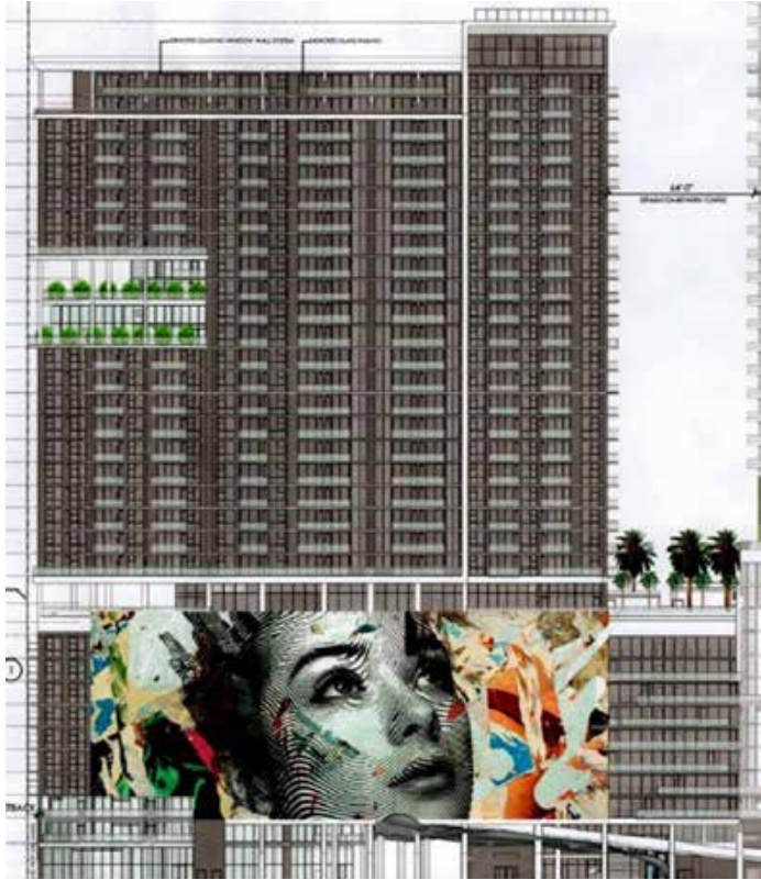
EAST ELEVATION - PREVIOUSLY APPROVED (2020)