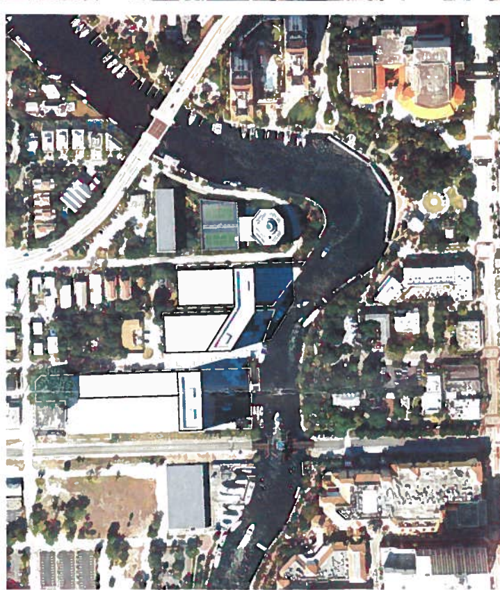
02 MARCH 21ST 12PM SCALE 1/2000' = 1'