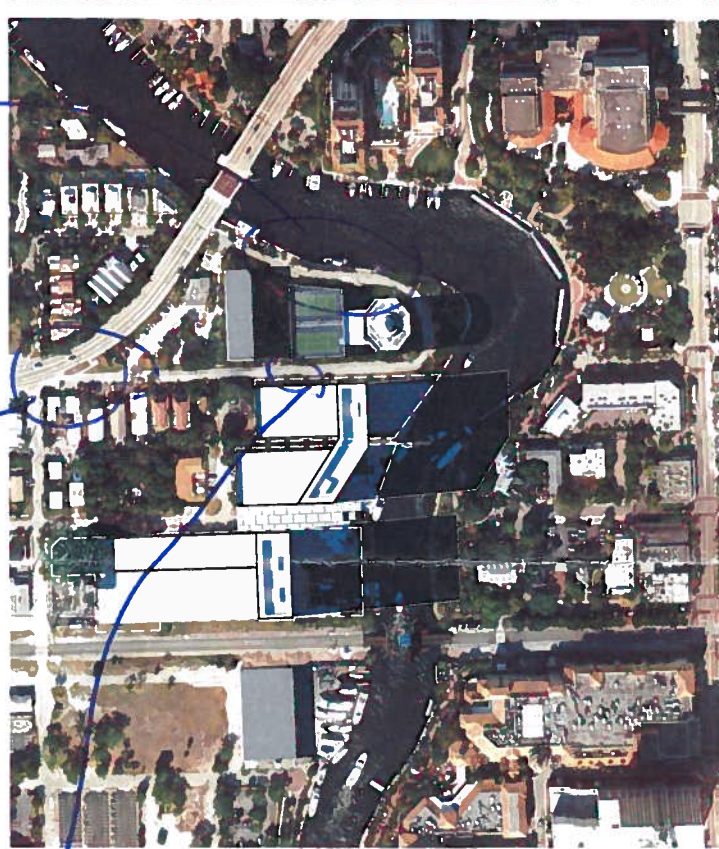
05 DECEMBER 22ND 12PM SCALE 1/2000' = 1'