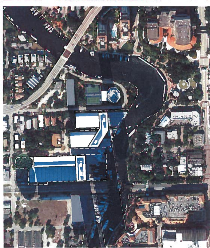
03 MARCH 21ST 5PM SCALE 1/2000' = 1'