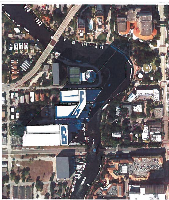
04 DECEMBER 22ND 9AM SCALE 1/2000' = 1'