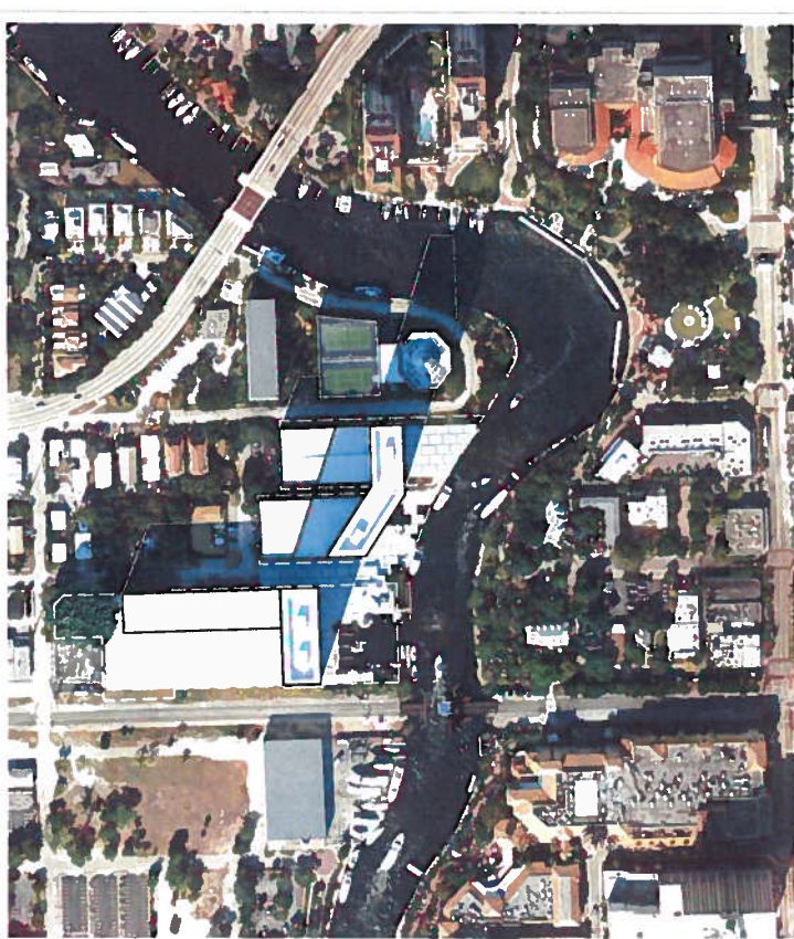
01 MARCH 21ST 9AM SCALE 1/2000' = 1'