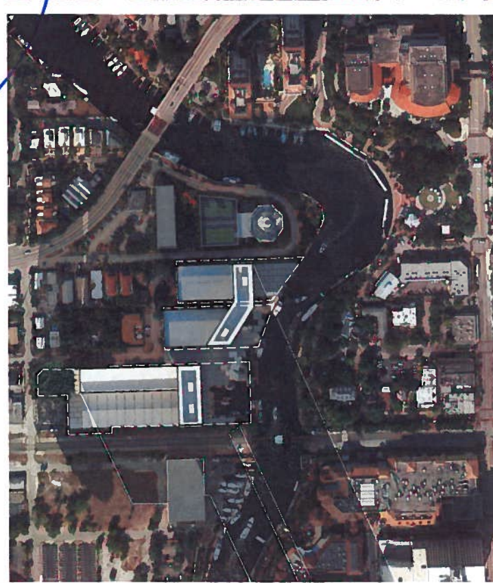
06 DECEMBER 22ND 5PM SCALE 1/2000' = 1'

Handwritten notes in blue ink: "Traffic Column", "H2O issue - floods", "left them only so", "Bryant".