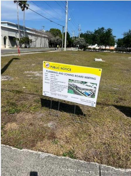
#2. View looking East from NE 6 th Terrace