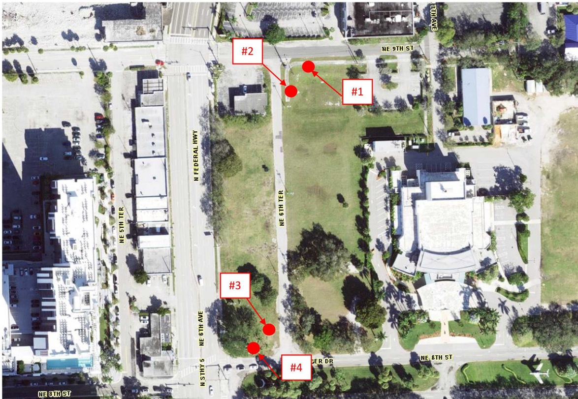
Aerial of Site

YMCA / Broward Health at Holiday Park Site Plan UDP-S24057