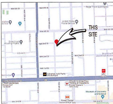
VICINITY SKETCH: NOT TO SCALE