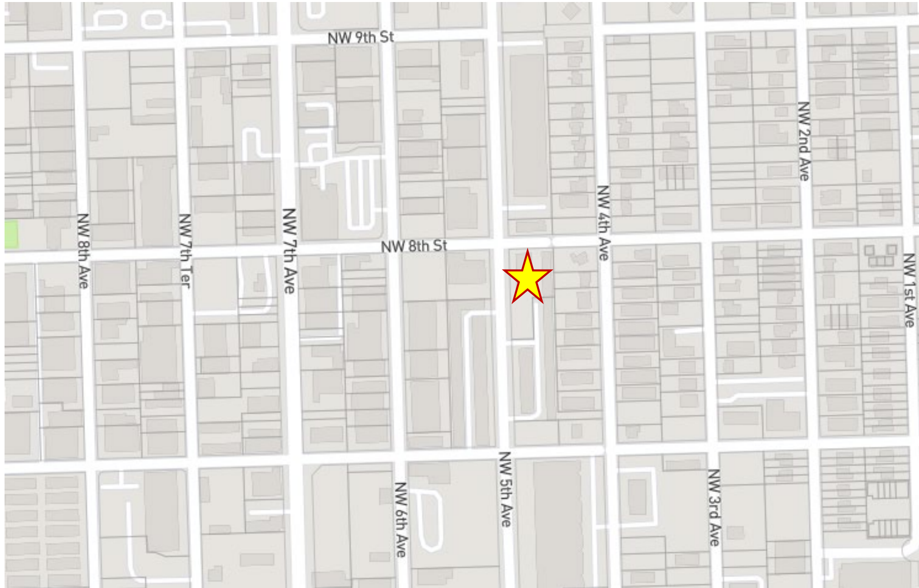
EXHIBIT C - EVENT LOCATION MAP