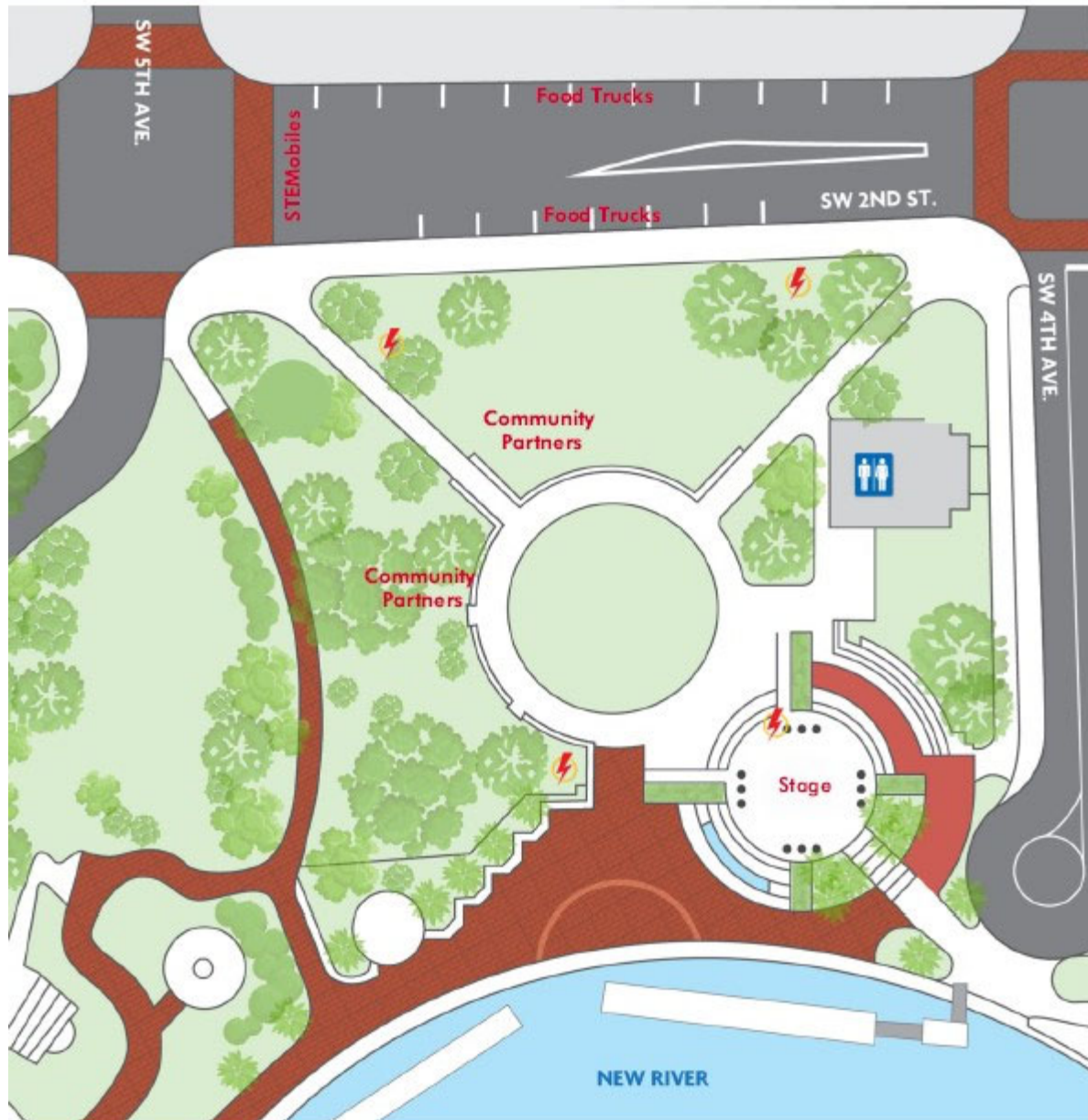
EXHIBIT D - Visit Lauderdale Science Festival