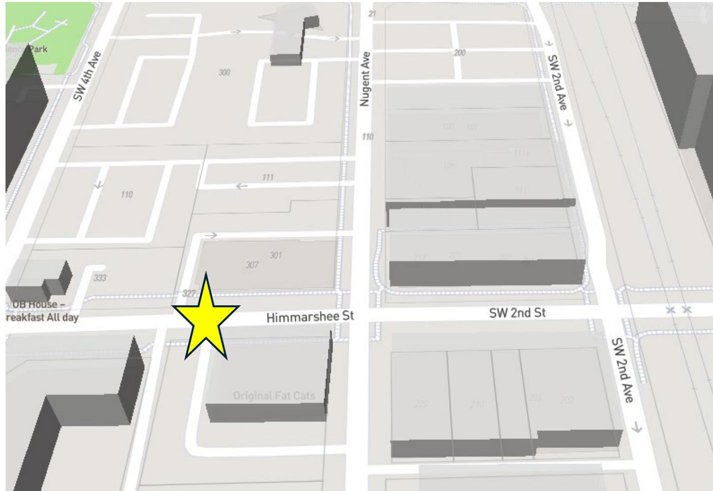
Exhibit C – Event Location Map