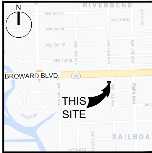
LOCATION MAP: NOT TO SCALE

SAID LAND SITUATED AND LYING IN THE CITY OF FORT LAUDERDALE, BROWARD COUNTY, FLORIDA, AND CONTAINING 1,000 SQUARE FEET OR 0.023 ACRES MORE OR LESS.