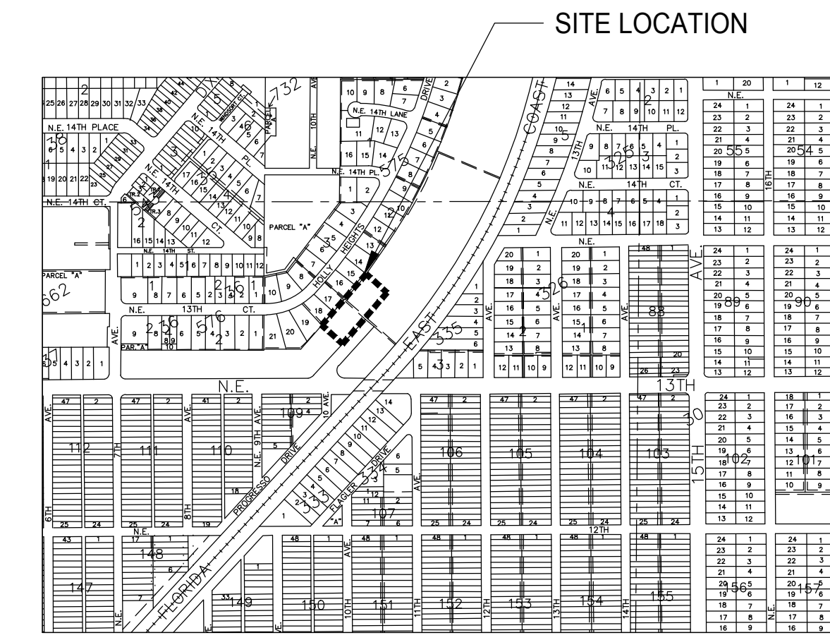
LOCATION SKETCH SCALE: N.T.S.

SAID LAND SITUATE LYING AND BEING IN THE CITY OF FORT LAUDERDALE, BROWARD COUNTY, FLORIDA.