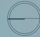
EXHIBIT "D" SITE PLAN MAP

SPACE USE AND SCHEDULE NHL All-Star Beach Festival - Secured, Free Thursday, Feb 2: 10:00-12:00, 12:00-8:00 Friday, Feb 3: 10:00 -6:00 Saturday, Feb 4: 10:00-6:00 NHL Red Carpet - Secured, Free Friday, Feb 3: 3:00 - 4:30 NHL All-Star Beach Bash - Secured, VIP Private Event Saturday, Feb 4: 6:30-10:30 Las Olas Oceanside Park NHL All-Star Official Merchandise Shop - Unsecured, Free Times TBD