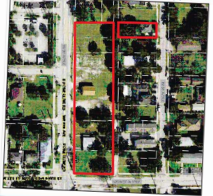
AERIAL PHOTOGRAPH (MAY NOT SHOW LATEST IMPROVEMENTS) (NOT-TO-SCALE)

PROPERTY ADDRESS: 500 - 534 NORTHWEST 9th AVENUE, FORT LAUDERDALE, FL. 33311