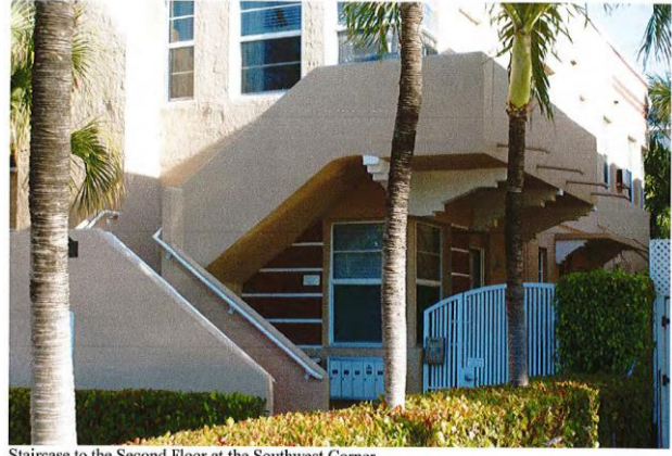
Staircase to the Second Floor at the Southwest Corner

Two significant architectural elements dominate the south facing façade of the apartment building. The first is a centered, outside chimney. The second important exterior element is a half turn staircase with a cantilevered balcony at the second floor level.