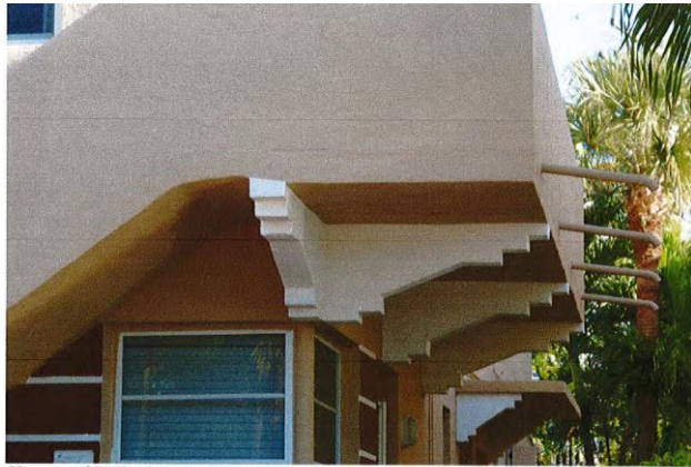
Close-up of Stylized Brackets Supporting Staircase