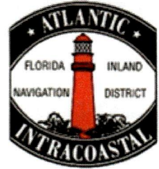
EXHIBIT F FLORIDA INLAND NAVIGATION DISTRICT ASSISTANCE PROGRAM PROJECT QUARTERLY STATUS REPORT