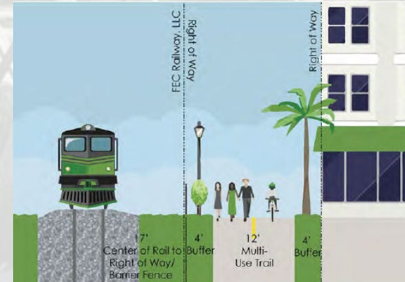
Proposed: The one-way drive lane is to be replaced with a 12' wide multi-use trail outside the FEC right-of-way.