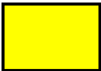
Mount Hermon Apartments Proposed Project