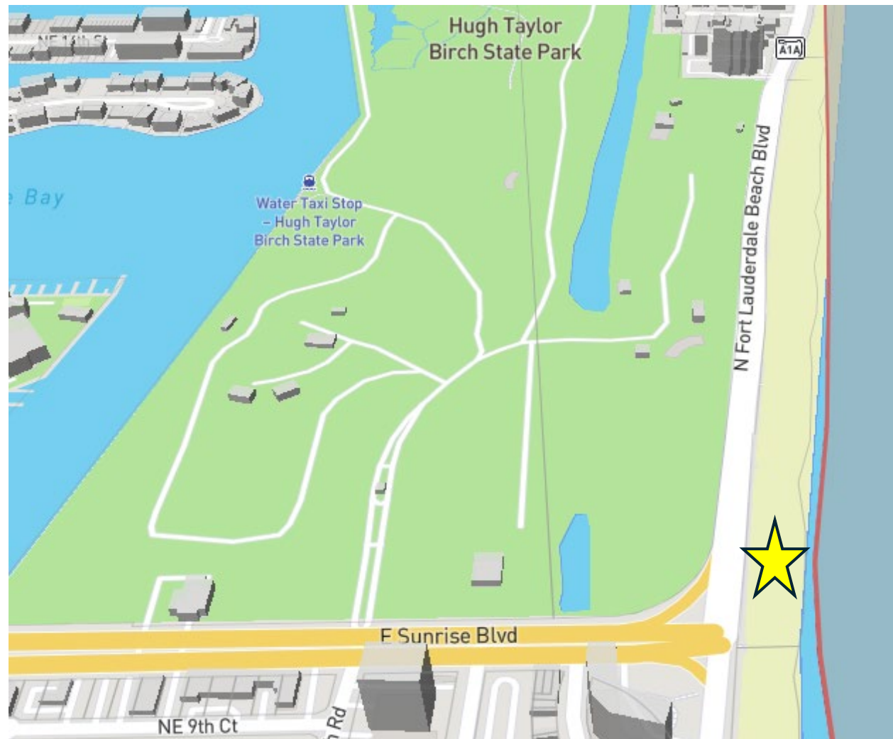
Exhibit C – Event Location Map