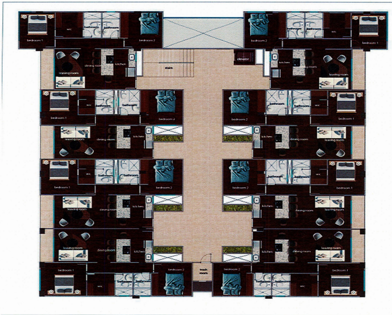
SECOND - FOURTH FLOOR PLAN NEW HOPE