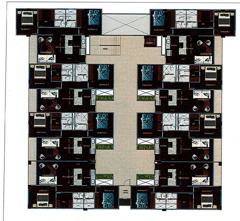
SECOND - FOURTH FLOOR PLAN NEW HOPE