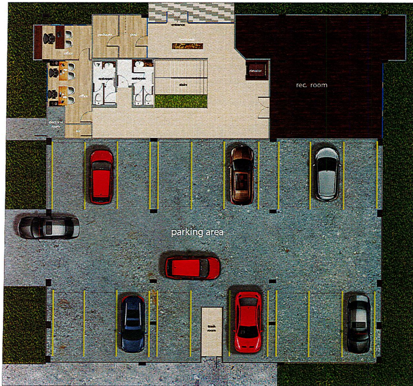
FIRST FLOOR PLAN NEW HOPE