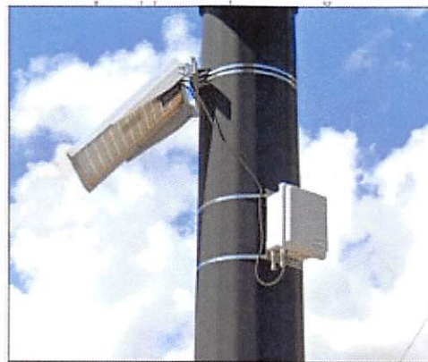
Deployed BlueTOAD Spectra unit at SR 84 @ US1

BlueARGUS – BlueTOAD Time-Based Performance Software provides: