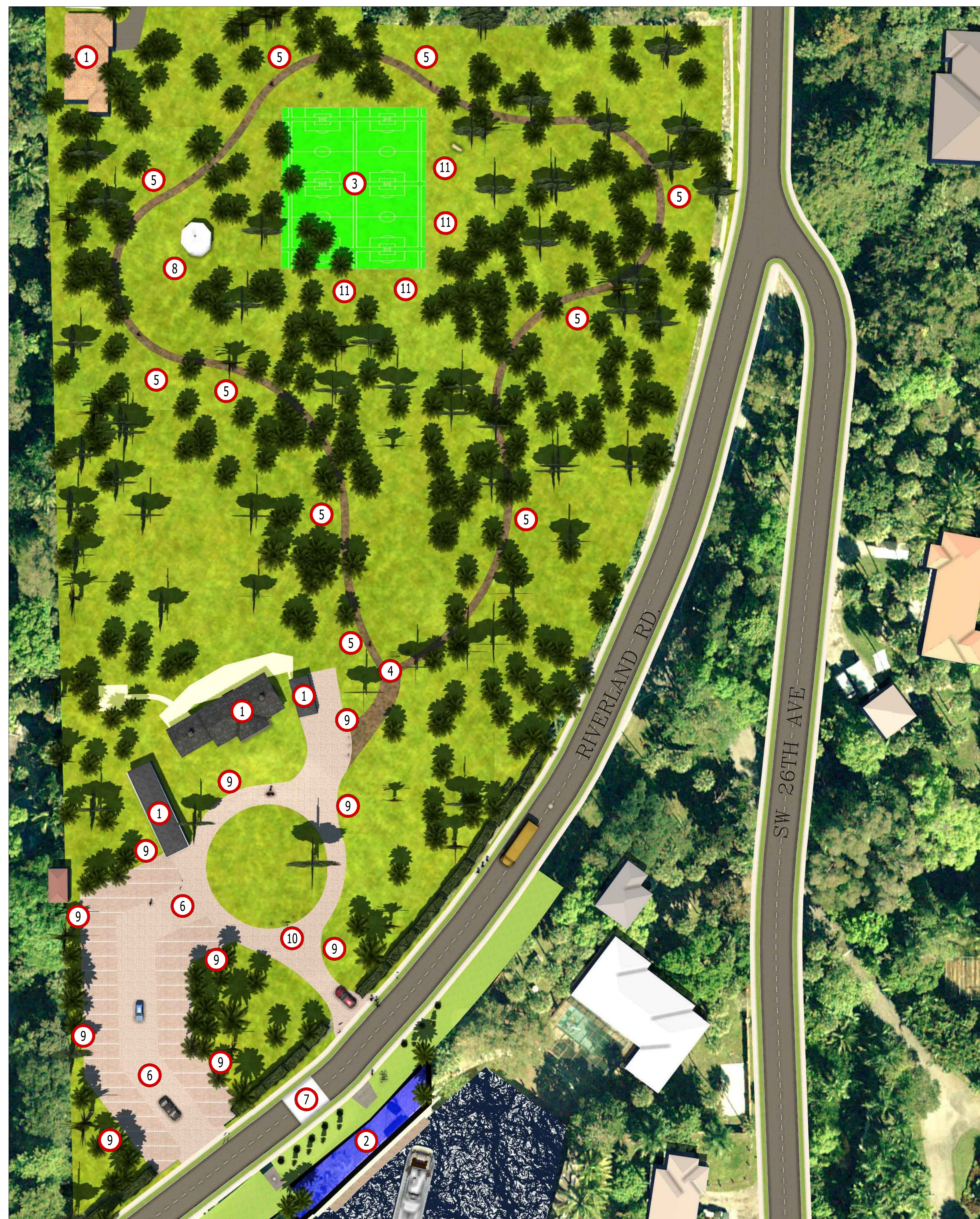
Black Property Concept PLAN VIEW