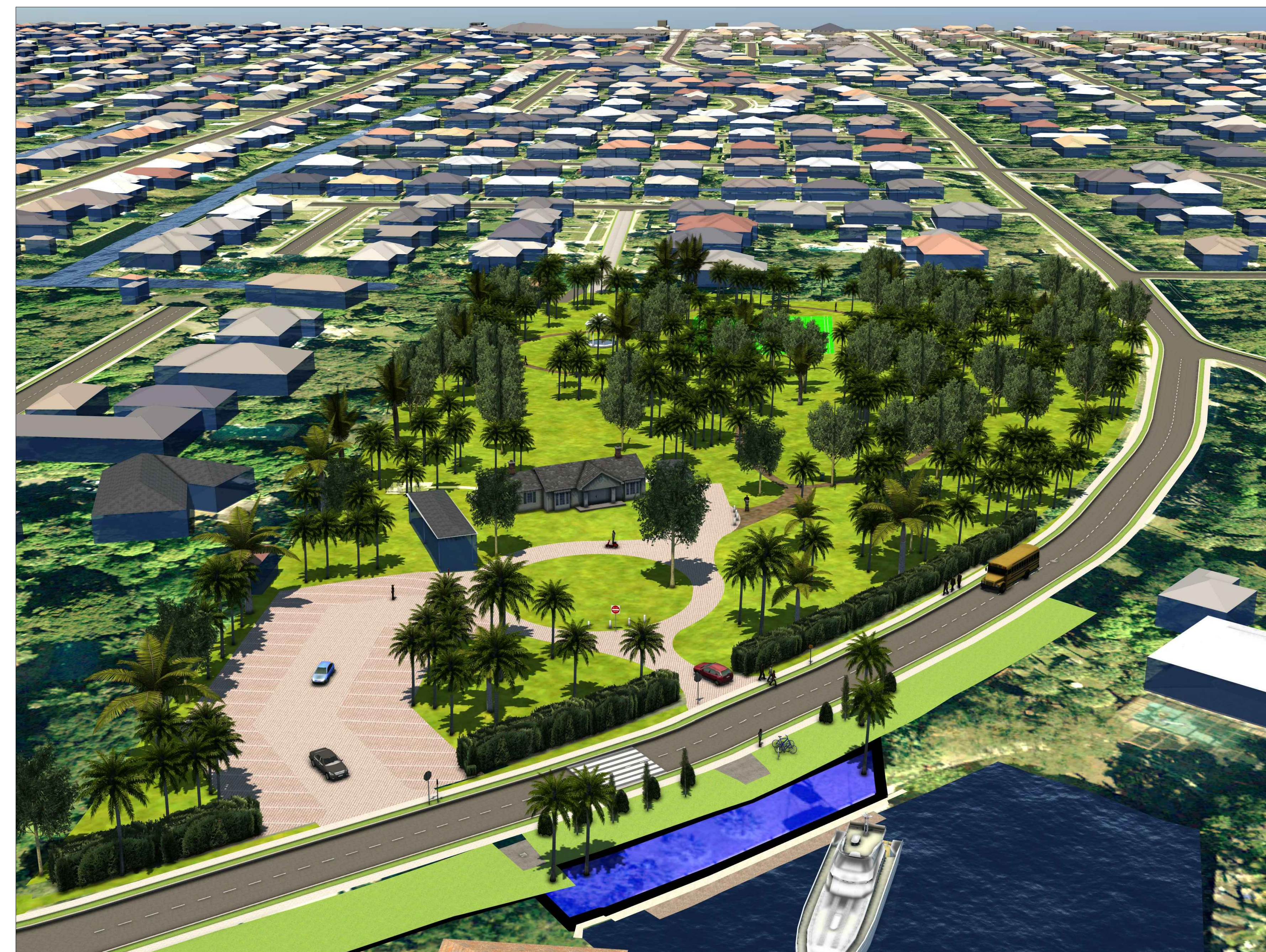
Black Property Concept FRONT PERSPECTIVE VIEW