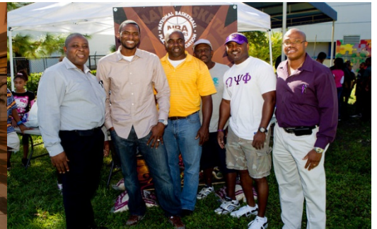
Assisting NBA Player Keyon Dooling in Turkey Giveaway