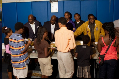
Serving families at Boys & Girls Clubs Thanksgiving Dinner