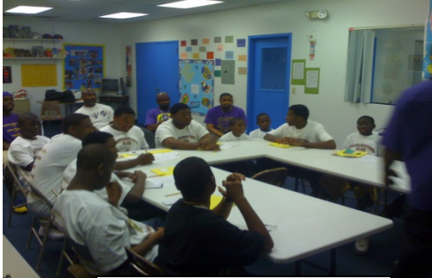
“Real Talk” Group Session