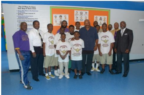
Meet & Greet with NFL Legend Jim Brown