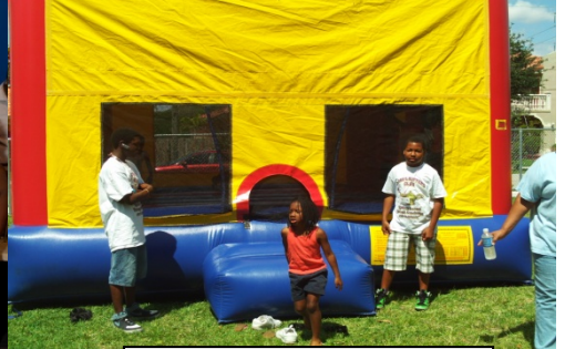
Volunteers at Walker Elementary School’s “Fun Day”