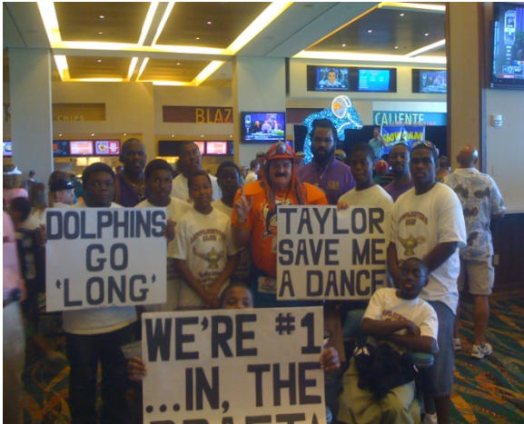
Field Trip to Miami Dolphins Football Draft