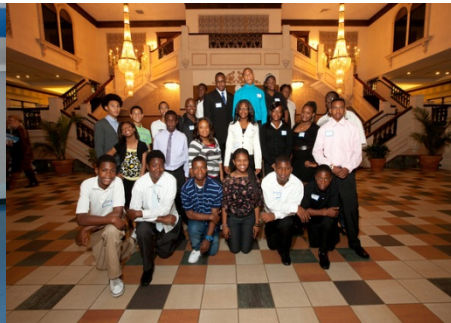
Participating in Boys & Girls Club Career & College Fair