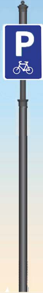
Bicycle Parking Sign