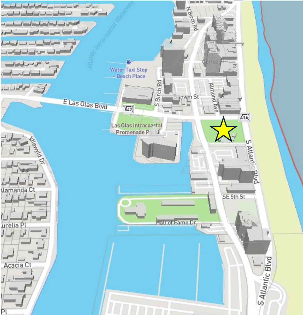
Exhibit C – Event Location Map