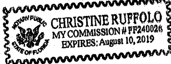
(Signature of Notary Public)

(Name of Notary typed, printed or stamped)