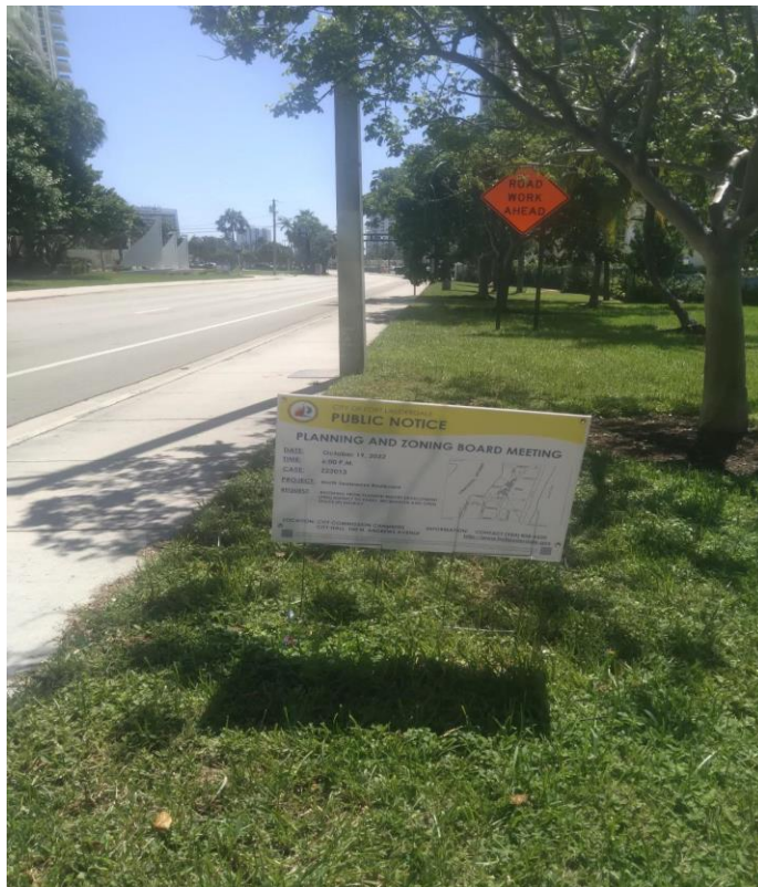
Sea Breeze Blvd – Facing South