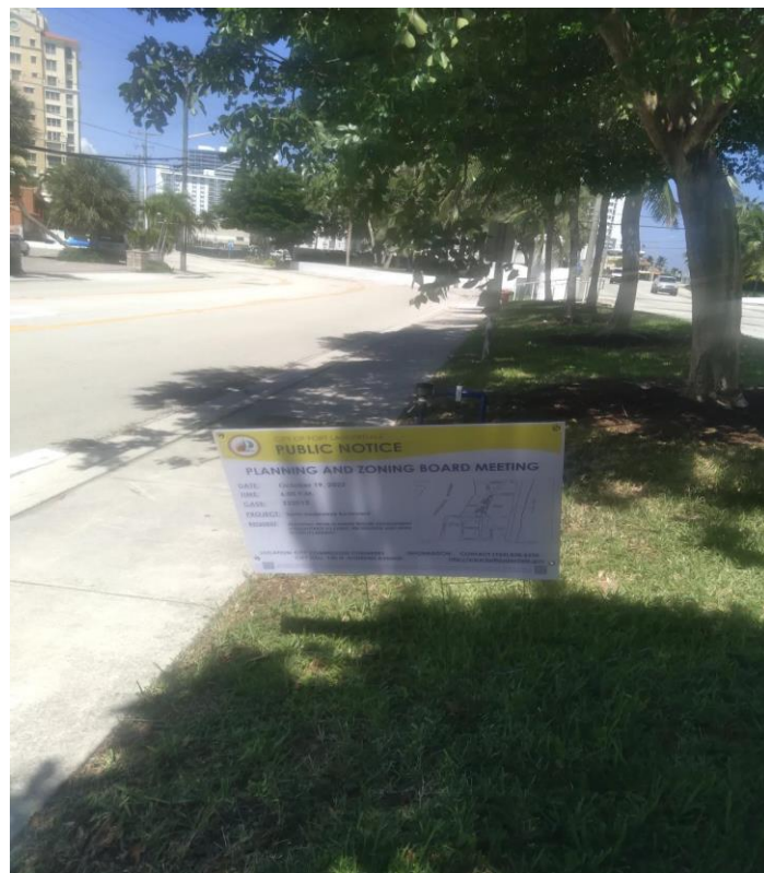
Birch Ave – Facing North