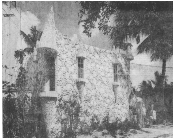
1974 Photograph of New River Castle 9

An original photograph or drawing of the bridge tender's quarters could not be located to determine its appearance at the time of construction. In 1973, a permit application for exterior modifications was filed; however other than the permit application, there are not any additional documents available on record.