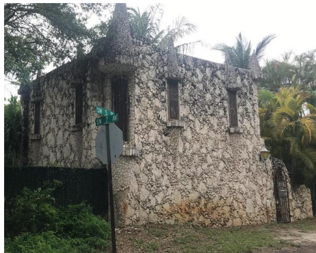
Photo of 625 SW 5th Place