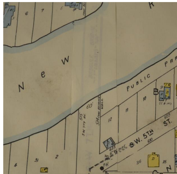
1966 Sanborn Map