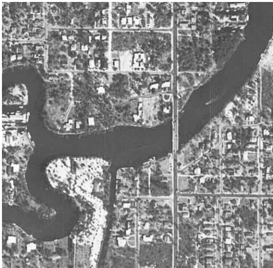
1947 Broward County Aerial Photo

The bridge tender's quarters was most likely constructed around the same time as the bridge and was located at the southeast corner of the bridge approach. The footprint of the bridge tender's quarters and Colee Avenue Bridge can be seen in the 1947 aerial photo of this location. Although the location of the bridge was changed in the 1960s, the residential structure that remains and its setting is a reminder of the early development within the City of Fort Lauderdale and transportation patterns at that time.