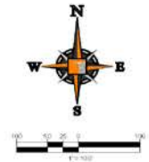
EXHIBIT NO. _____