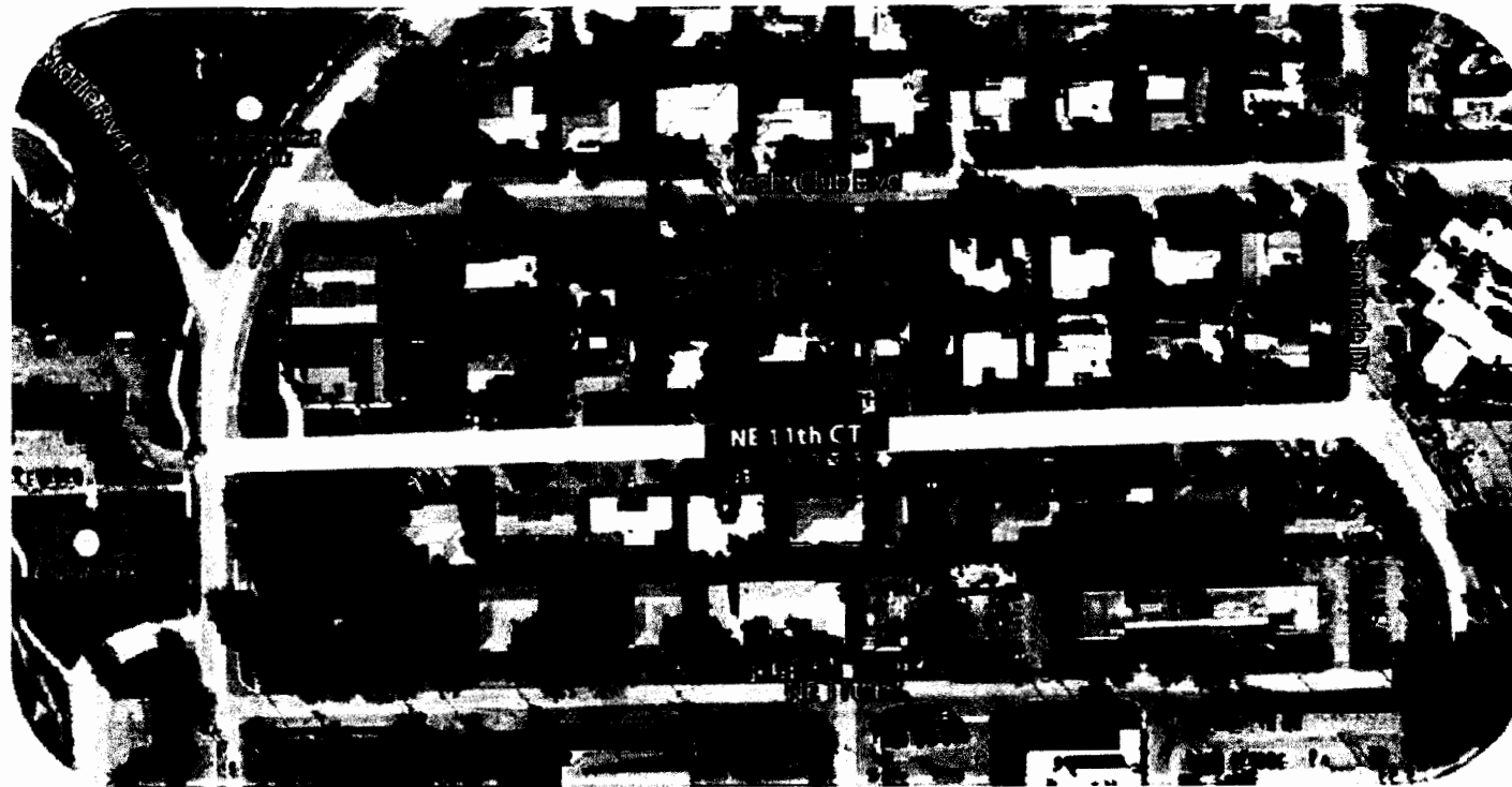
Exhibit 1 Location Map