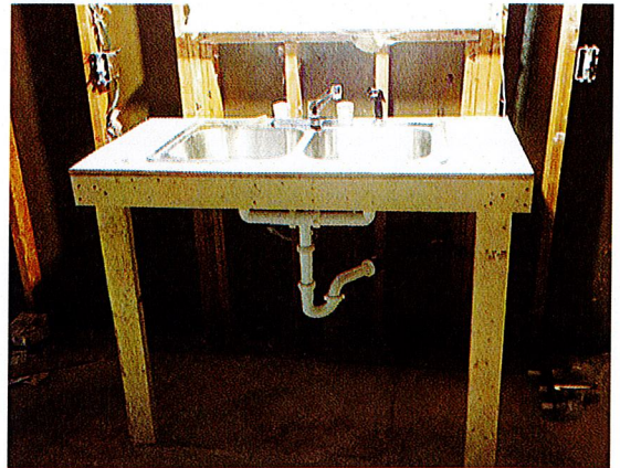
The kitchen sink is framed in and missing cabinets but functional.