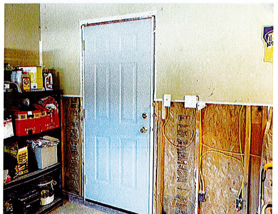
Exterior doors will provide a secure entry and exit.