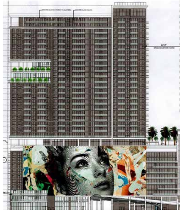
EAST ELEVATION - PREVIOUSLY APPROVED (2020)