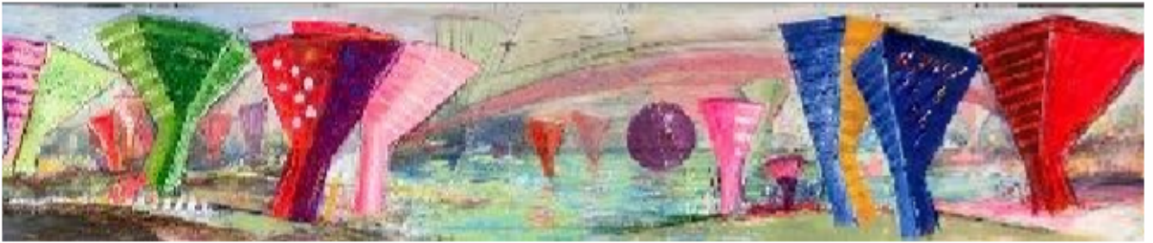
A rendering of the mural (with approximate dimensions)