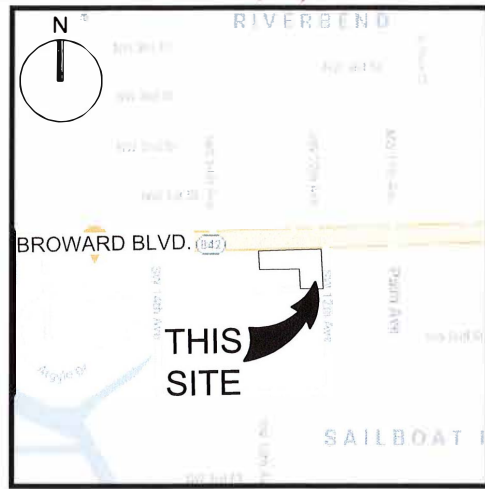
LOCATION MAP: NOT TO SCALE

SAID LAND SITUATED AND LYING IN THE CITY OF FORT LAUDERDALE, BROWARD COUNTY, FLORIDA, AND CONTAINING 36,846 SQUARE FEET OR 0.846 ACRES MORE OR LESS.