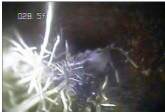
Roots in Sewer

EnviroWaste's CCTV (closed captioned television) inspection uses custom controlled cameras to locate wreckage within the pipes. Our remote-controlled cameras operate on a four-wheel sled and allow the customer to see the exact condition of their drainage system to identify the problem and its severity. EWSG even offers a new technology that provides cured in place lining services which rehabilitates damaged pipes of any diameter without the costly excavation, while keeping disruptions of service to the very minimum.