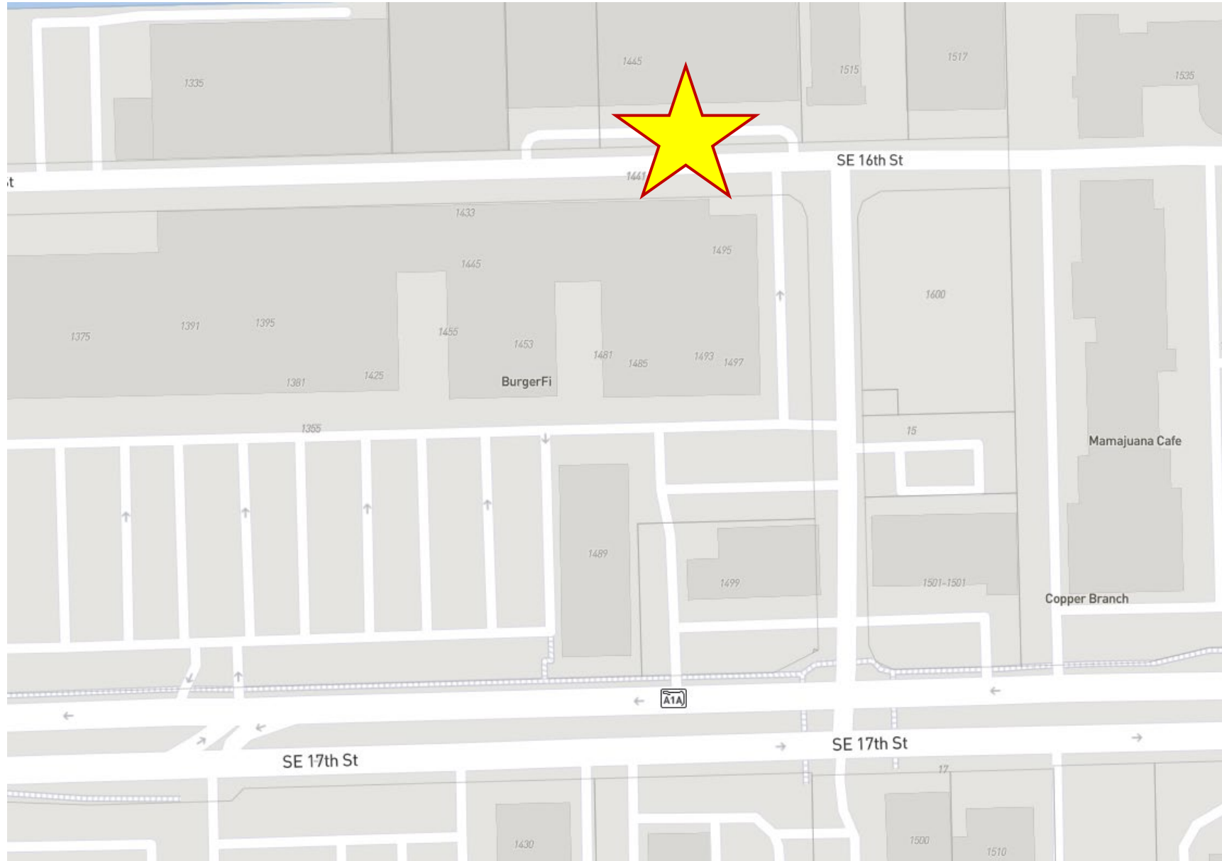
EXHIBIT C - Cavallino Classic Tour Lunch