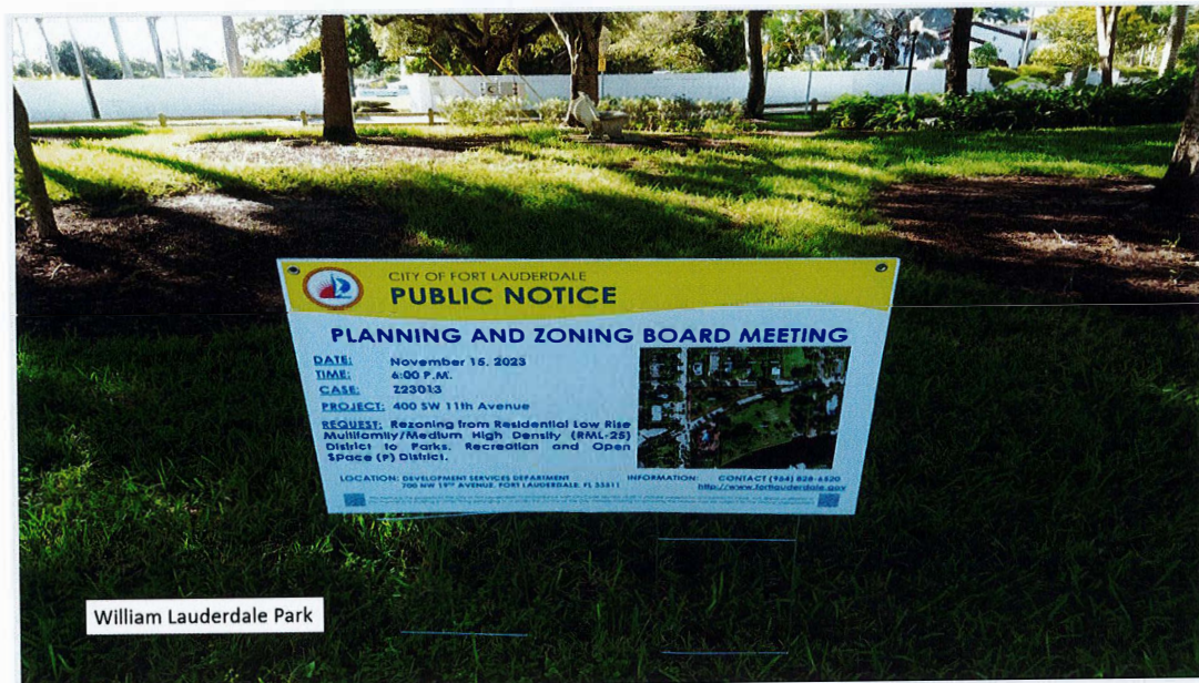
William Lauderdale Park