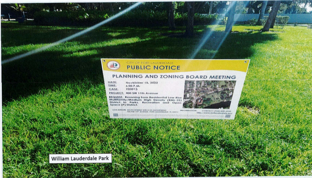
William Lauderdale Park