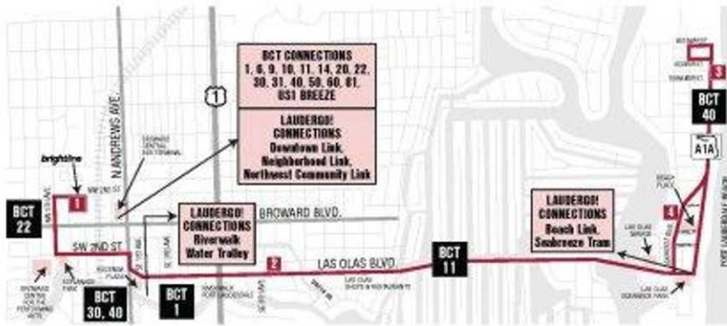
Detour using Nugent Street, then Broward Boulevard is in effect due to road closures on SW 2nd Street.