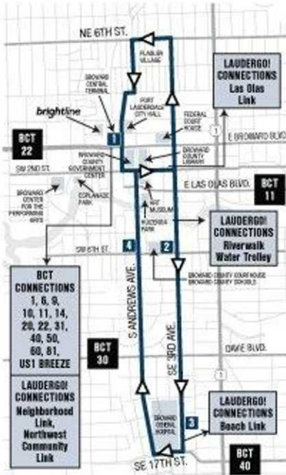
Pick-up and Drop-off in all Broward County Transit Stops along the route