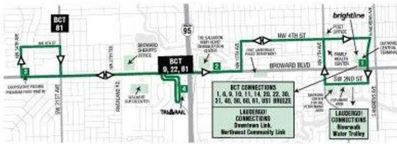
Pick-up and Drop-off in all Broward County Transit Stops along the route