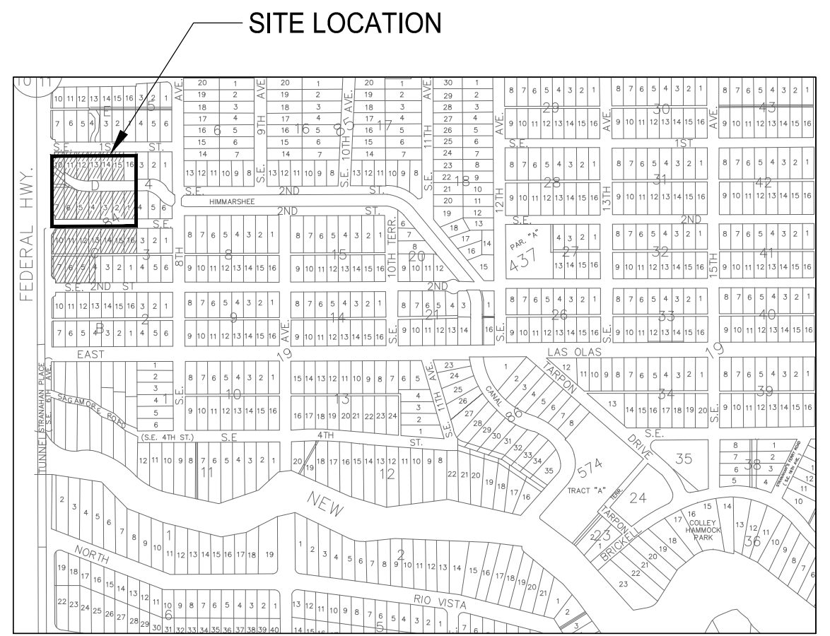
LOCATION SKETCH SCALE: N.T.S.