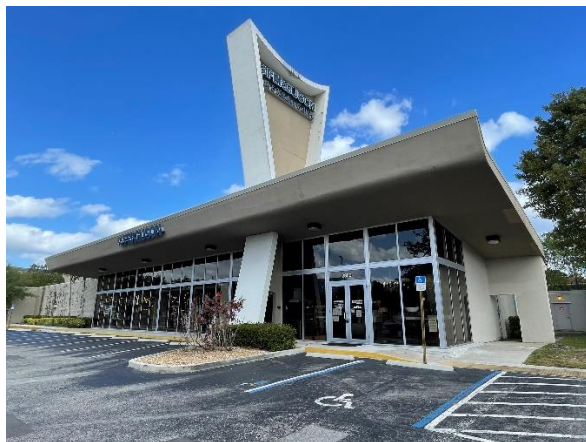
Photo of Existing Site

Historic Landmark Designation is requested for the property located at 2860 N. Federal Highway, commonly known as Castro Convertibles.