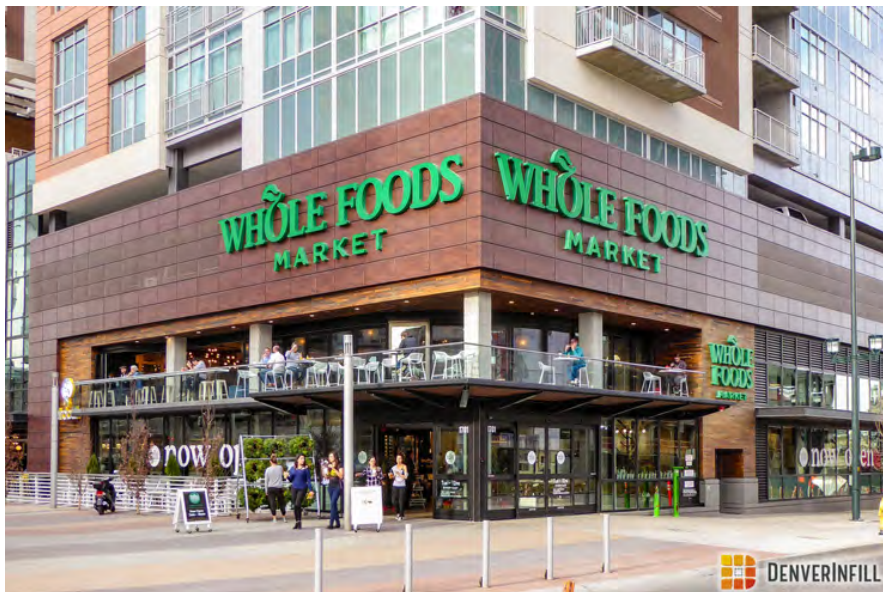
Accentuate Corner Elements