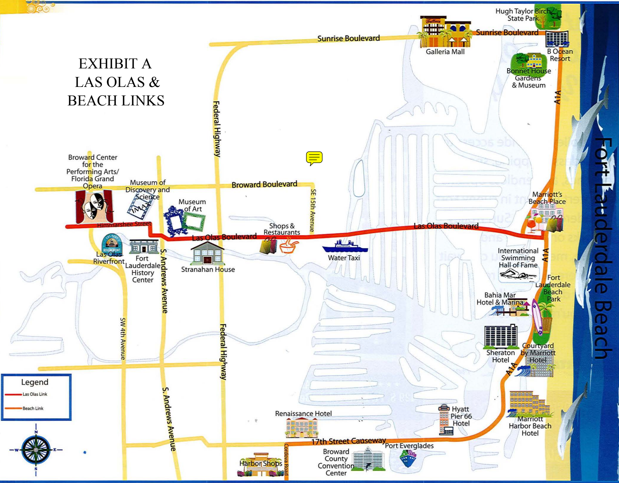
EXHIBIT A LAS OLAS & BEACH LINKS