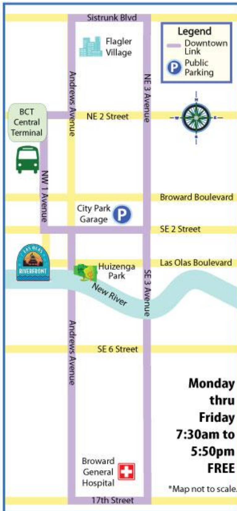
EXHIBIT A DOWNTOWN LINK