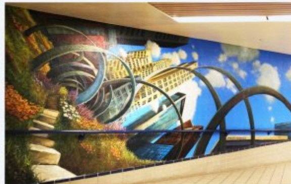
Artist: Timothy Robert Smith Title: Upside Downtown Toledo (details) Year Completed: 2020 Dimensions: 8' x 256' Material: Acrylic paint on Polytab (non-woven media) Commissioning Entity: The Arts Commission, Toledo Budget: $27,000 Location: One Seagate Building, Toledo, OH Description: A long tunnel mural featuring various activities and iconic buildings in Toledo, OH.