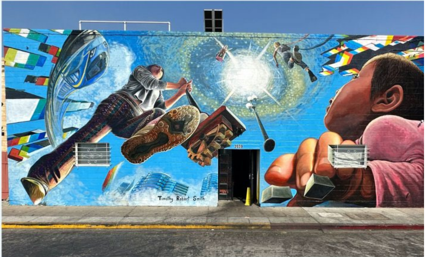
Artist: Timothy Robert Smith Title: Ripple Effect IV Year Completed: 2023 Dimensions: 25' x 50' Material: Acrylic on Polytan and acrylic on wall Commissioning Entity: Redwood City Arts Budget: $15,000 Location: Zareen's Restaurant, Redwood City, CA Description: "Women of the Future" themed mural depicting technology used to access new dimensions.