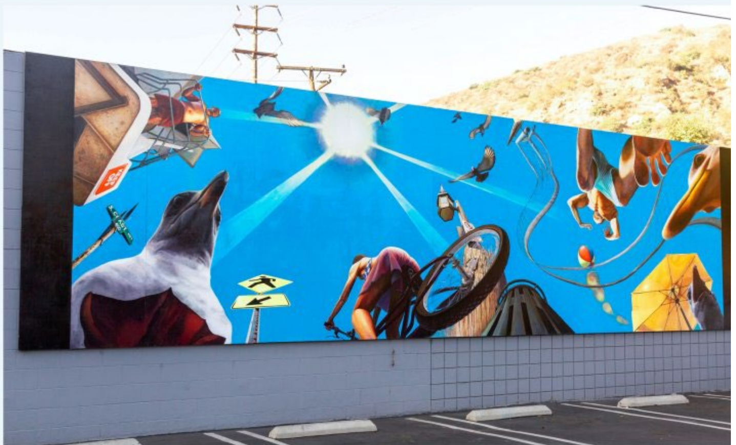
Artist: Timothy Robert Smith Title: Upside Downtown Laguna Beach Year Completed: 2017 Dimensions: 10' x 34' Material: Acrylic paint on wood Commissioning Entity: Laguna College of Art and Design Budget: $10,000 Location: Laguna Beach, CA Description: Laguna Beach is seen from below the ground looking up. This was the first of many murals the city with a similar perspective.