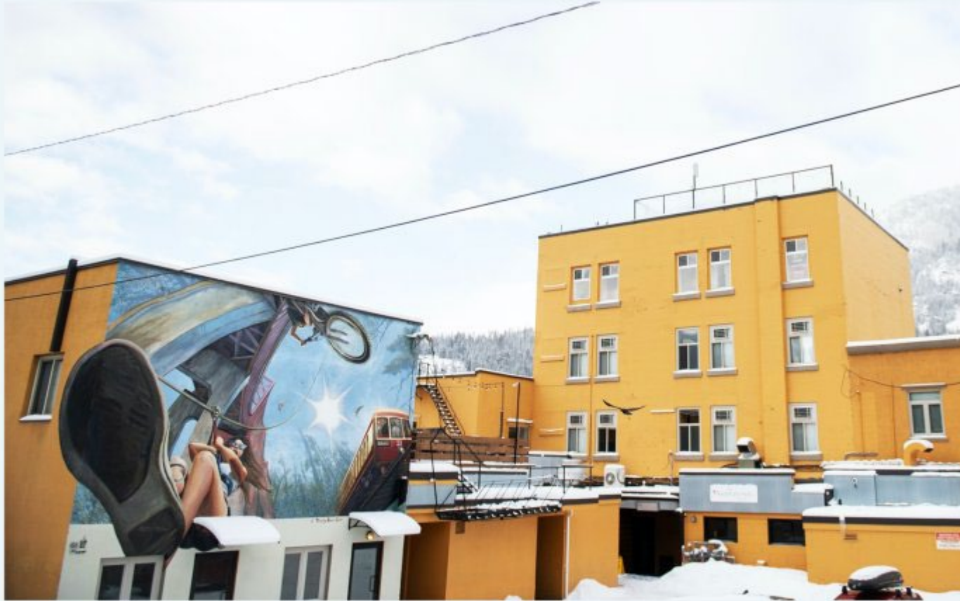
Artist: Timothy Robert Smith Title: Passageway Year Completed: 2022 Dimensions: 35' x 40' Material: Acrylic paint on Polytab (non-woven media) Commissioning Entity: Nelson International Mural Festival Budget: $4000 Location: The Adventure Hotel, Nelson, BC, Canada Description: A mural featuring activities in Nelson: ziplining, mountain biking, and street car riding.