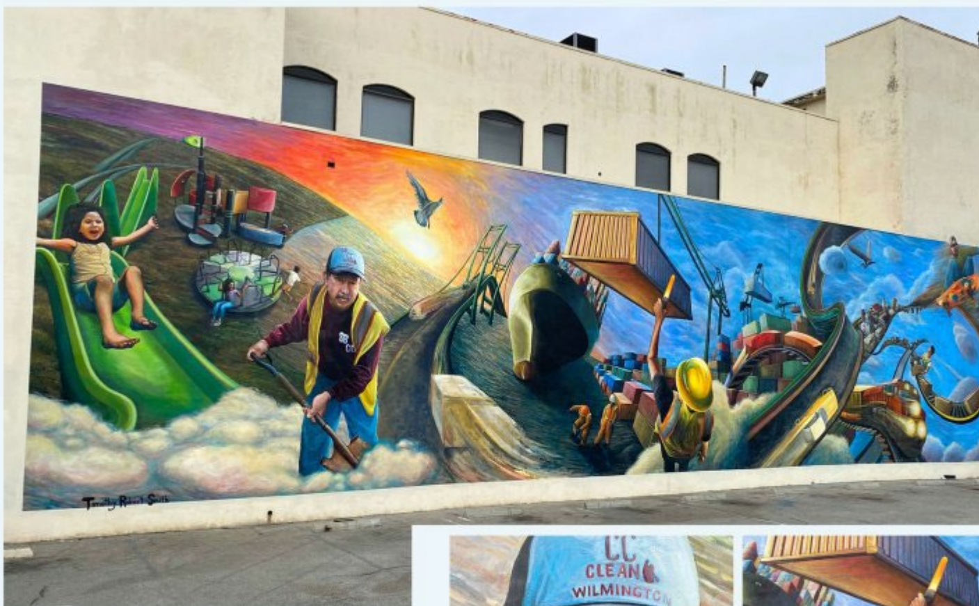
Artist: Timothy Robert Smith Title: Apparatus Year Completed: 2021 Dimensions: 25' x 70' Material: Acrylic paint on plaster wall Commissioning Entity: Department of Cultural Affairs Budget: $66,109 Location: Wilmington Municipal Building, Los Angeles, CA Description: A mural commemorating the Port of Los Angeles, local parks and community leaders.