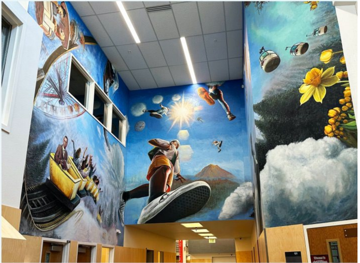
Artist: Timothy Robert Smith Title: Ripple Effect III Year Completed: 2023 Dimensions: 20' x 50' Material: Acrylic on canvas on wall Commissioning Entity: Washington State Arts Commission Budget: $44,636 Location: Ferrucci Jr High, Puyallup, WA Description: A mural about Jr High students flying to heights; featuring an iconic local fair.