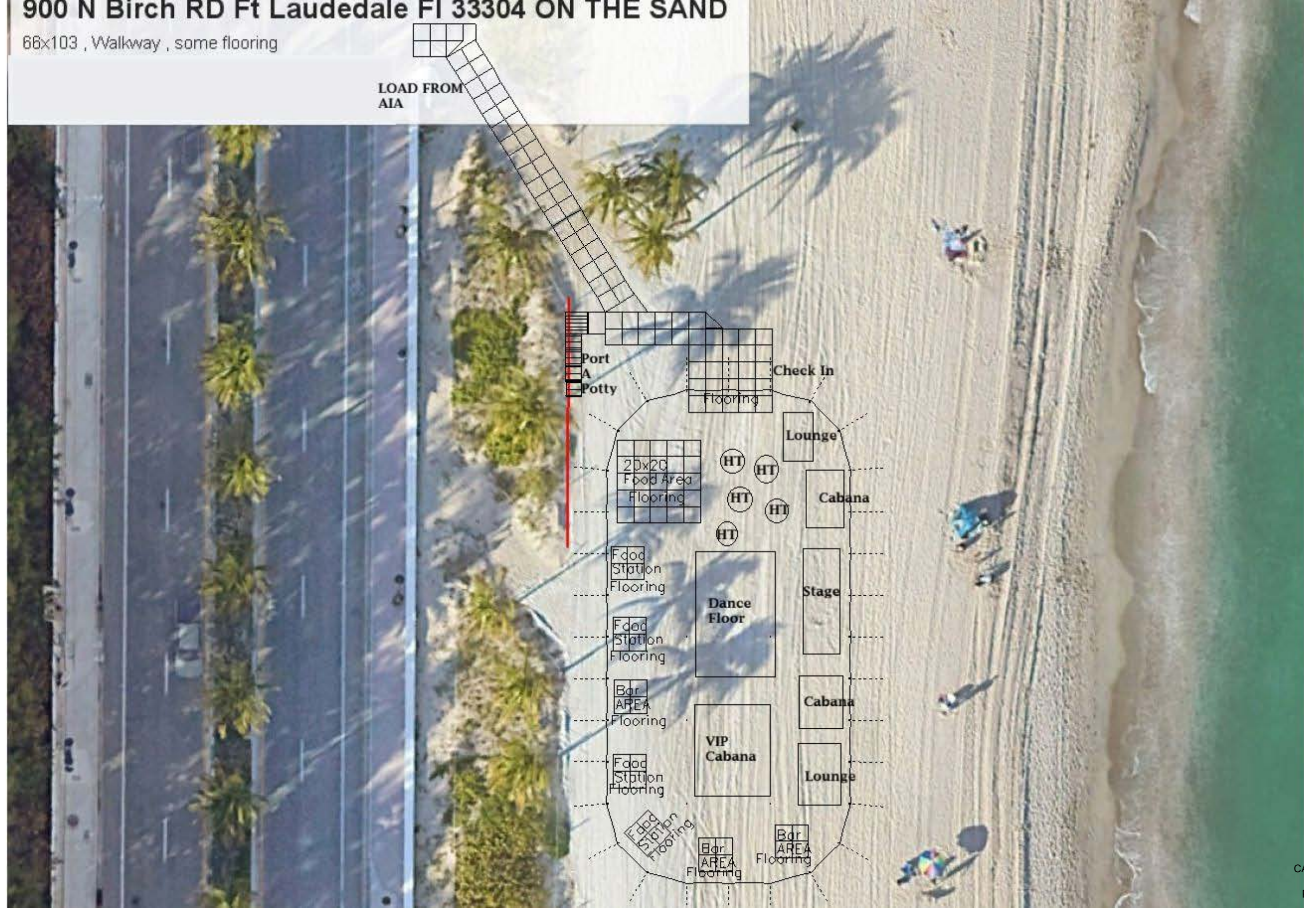
EXHIBIT D: Handy Moonrise Presented by Moss Foundation