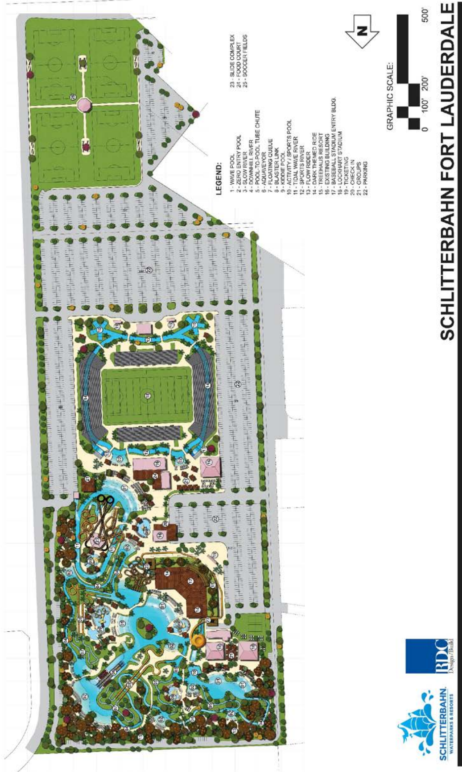
EXHIBIT B CONCEPTUAL SITE PLAN