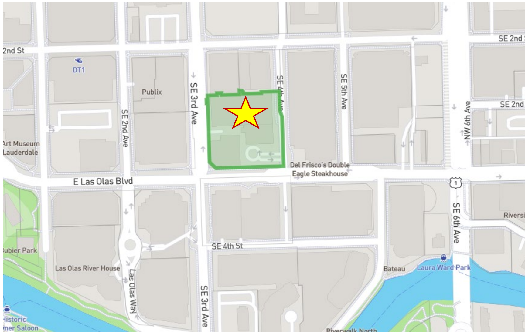
EXHIBIT C - Event Location Map