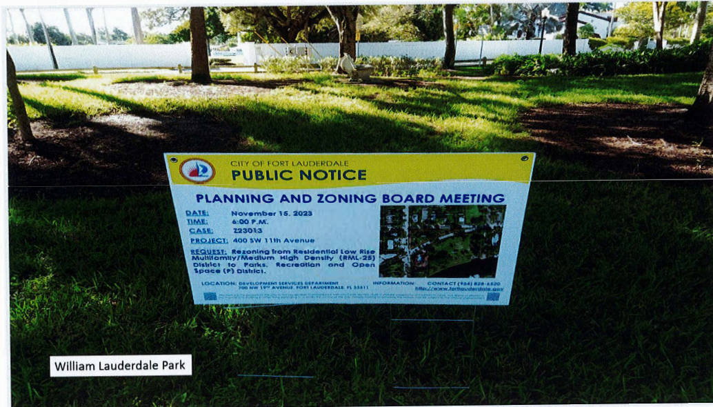
William Lauderdale Park