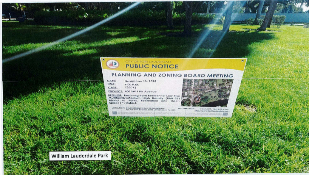
William Lauderdale Park