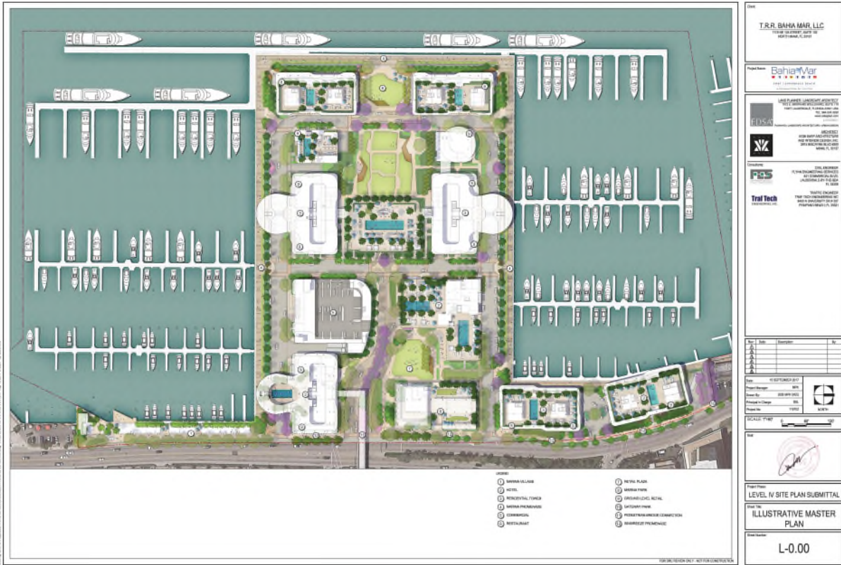
EXHIBIT G SITE PLAN