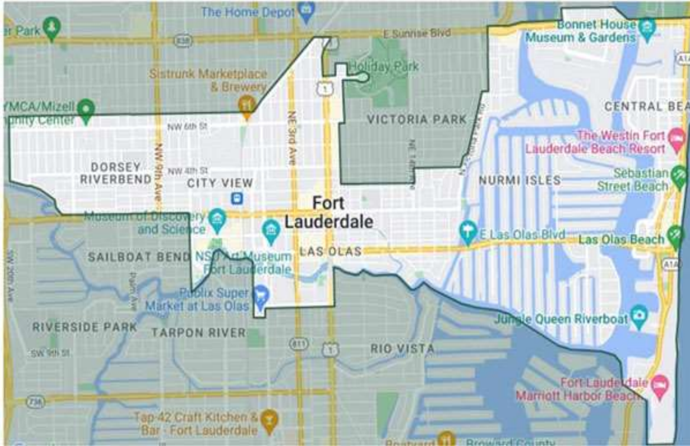
Exhibit F – Downtown Service Area